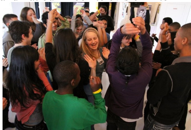
Dancing with my GTL family during some downtime.