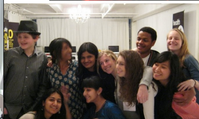
Hanging out with some of my GTL family.