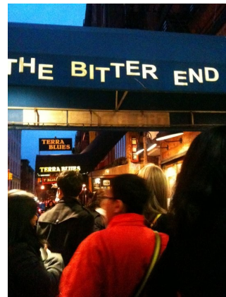
Heading to The Bitter End for some evening dancing and entertainment.