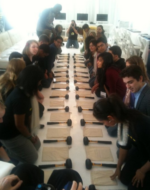
The 'Breaking of the Mosaic.'