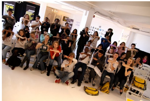
The GTL's and We Are Family facilitators tole-ranting for a Just Peace.